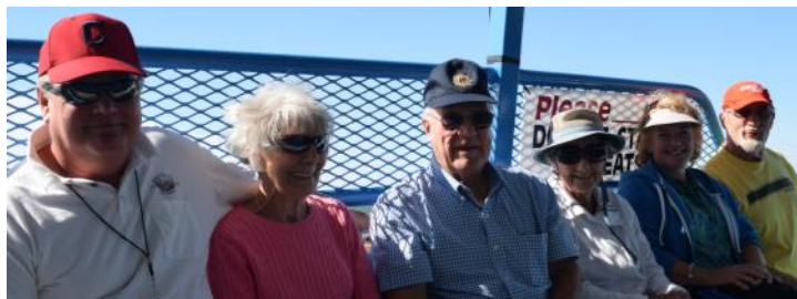
Some of the Lodge #4 members aboard Miller ferry.

On September 10, 2015, Lodge #4 resumed bi-weekly meetings with a trip to Put-in-Bay. Twenty members and guests attended. Those living on the mainland began with a Miller Ferry Line boat ride to South Bass Island where they joined lodge members from Put-in-Bay for lunch. Tours of the Lake Erie Islands Historical Society museum and Perry's Victory and International Peace Memorial followed. September 10 was the 202 nd anniversary of Perry's Victory in the Battle of Lake Erie. Lodge #4 returned to Green Island Restaurant, Bay Village, OH, for luncheon meetings on September 24.